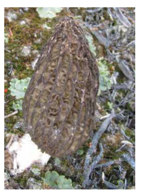
Typical Fire Morel Morchella conica