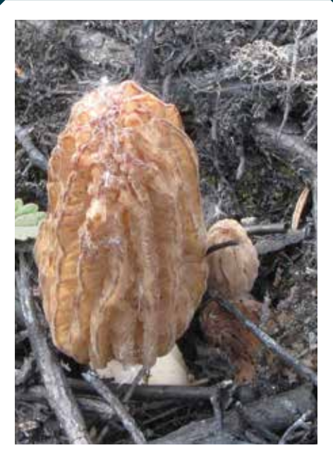
Yellow Morel M. esculenta