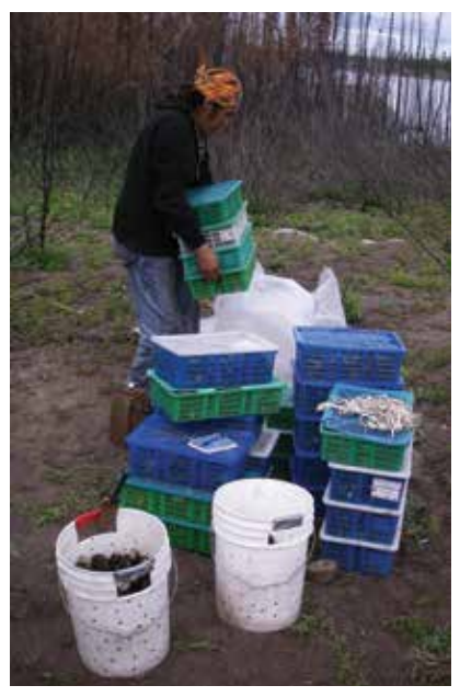
Proper Collection Techniques