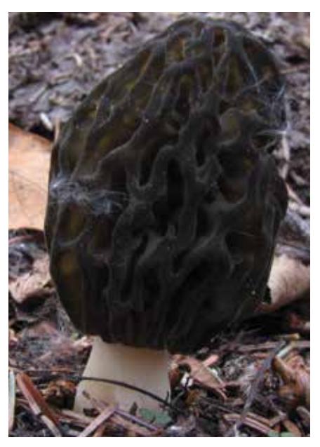
Black Morel M. elata