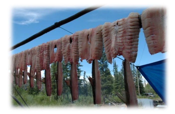
Traditional food preparation - smoked fish demonstration