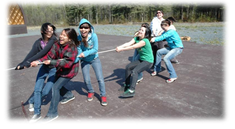
In the spirit of tradition, students had fun with Dene games sessions