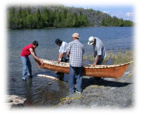
Checking for leaks