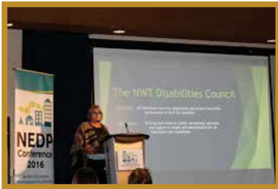
The NWT Disabilities Council discusses the advantages of hiring people with disabilities

This year, the theme of the event was “Northern Success Stories: Innovation and Economic Diversification”. The conference was aimed at building capacity by giving attendees the tools needed to enhance service to businesses in NWT communities.