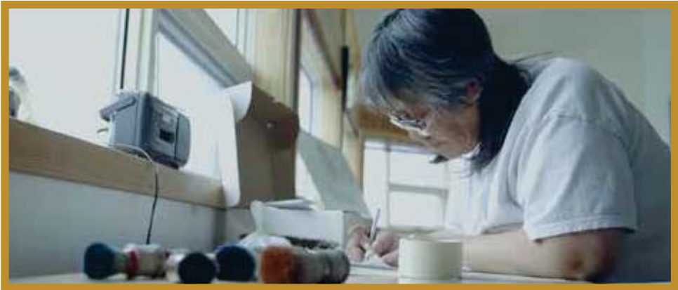
Print-making at the Ulukhaktok Arts Centre