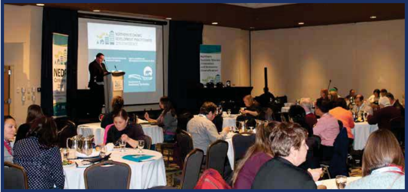
The Honourable Wally Schumann addresses the more than 100 attendees who gathered for NEDP 2016