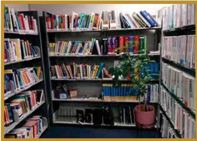
The BDIC's business library: books can be checked out for free and shipped anywhere in the territory.