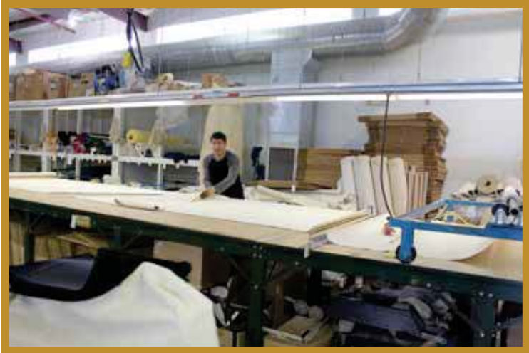
The factory floor at Fort McPherson Tent & Canvas