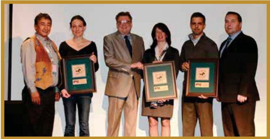
Gaia Integrative Clinic, Yamouri Inn, and Sunrise Cabinets receive their Outstanding Business Performance Awards