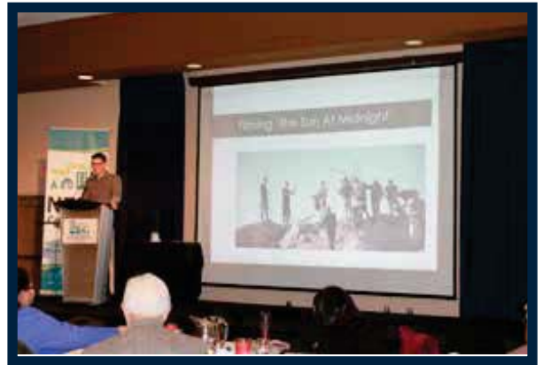
The NWT Professional Media Association highlights the positive economic and social impacts of the territory's growing film sector

Feedback gathered at the conference was positive: attendees felt that the presentations gave them valuable information that will help support businesses and economic development in their communities.