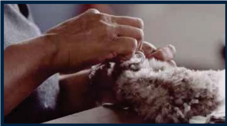
A hand-knit garment in progress at Dene Fur Clouds