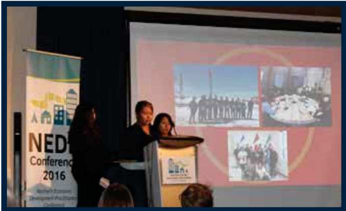
The Tłı̄ch̄q Region Economic Development Working Group showcase recent successes and future