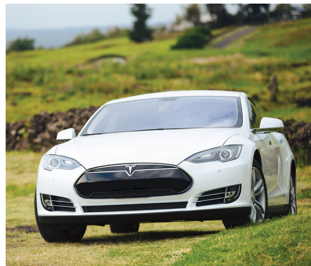
Cobalt is used in electric vehicle batteries.

In a typical Lithium Cobalt Oxide (LCO) battery, used in cell phones, laptops and cameras, cobalt is used as the positive electrode with approximately 60 per cent cobalt by weight. In electric vehicle batteries and power tools there is between 10-20 per cent cobalt by weight.