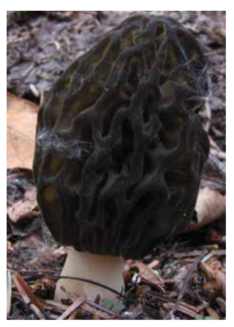
Black Morel M. elata