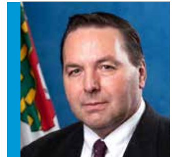
The Honourable Wally Schumann

Our aggressive approach to addressing challenges during this time of transition has resulted in cutting-