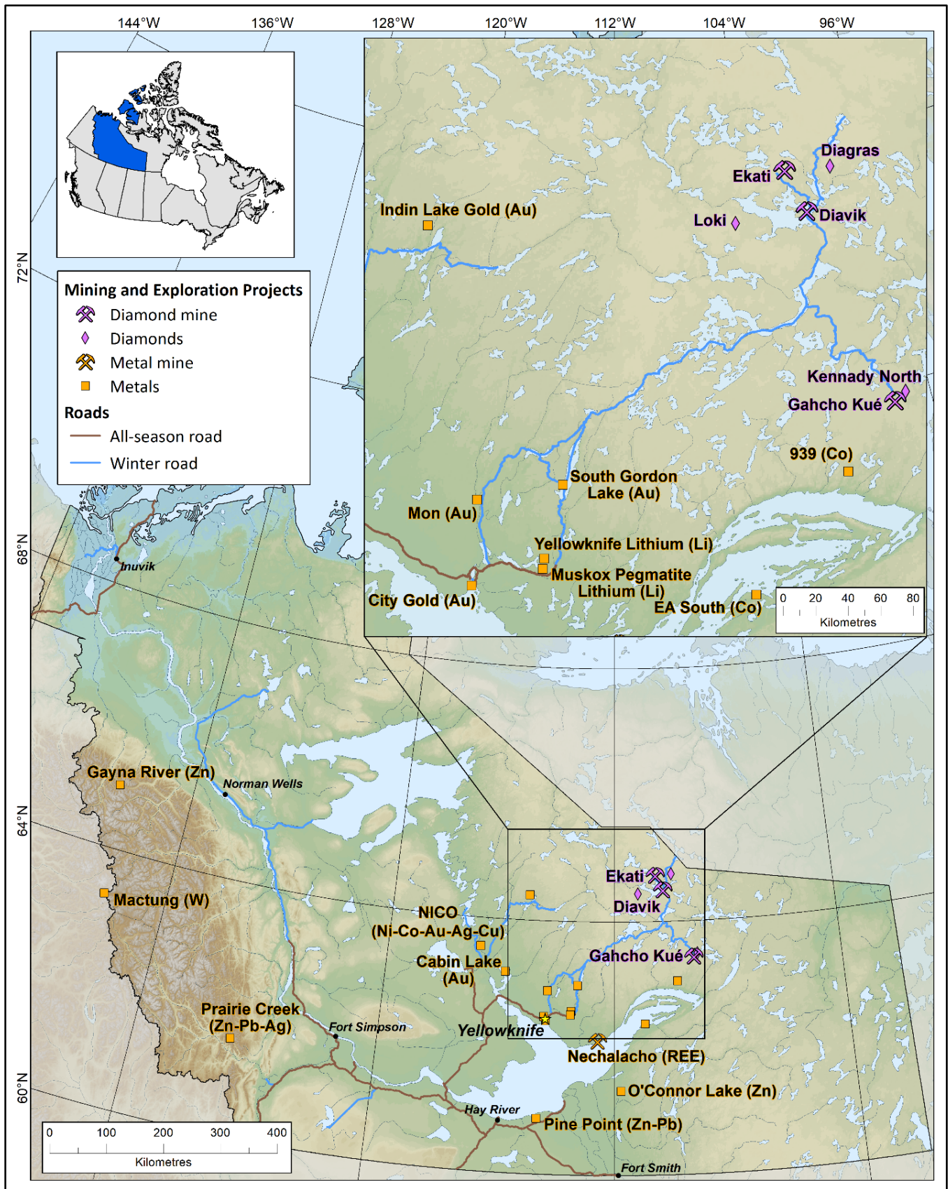
Figure 1. The locations of 2022 mining and exploration projects.