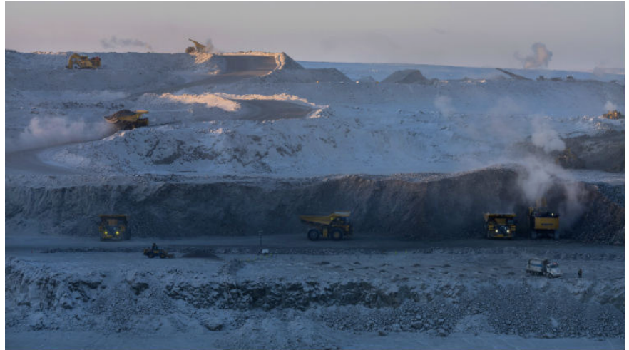
Mine operations at Gahcho Kué Diamond Mine

September 2017 marked the end of the first full year of operations at the Gahcho Kué Diamond Mine. The mine is operated by the De Beers Group of Companies (51%) and Mountain Province Diamonds (49%). It opened two months ahead of schedule and during 2016, produced 847,000 carats from 515,000 tonnes of kimberlite. The declaration of commercial production was made at the beginning of March 2017 with mine operations performing well and the diamond recovery plant running at nameplate capacity.