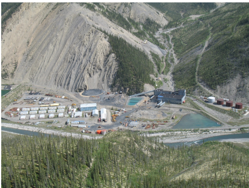
Prairie Creek site from above

The Feasibility Study included a new (August 2017) Mineral Reserve estimate of 8.1 million tonnes of Proven and Probable Reserves at a combined grade of 16.75% lead and zinc plus 124 grams of silver per tonne, which represents a 6% increase in reserve tonnage over the 2016 calculations. The estimate was prepared by H. A. Smith of AMC Mining Consultants (Canada) Ltd. and is based upon a Measured and Indicated Resource of 8.7 million tonnes grading 9.5% zinc, 8.9% lead and 136 grams of silver per tonne. An additional Inferred Mineral Resource of 7.0 million tonnes grading 11.3% zinc, 7.7% lead, and 166 grams of silver per tonne has the potential to be upgraded and to increase the current anticipated mine life of 15 years.