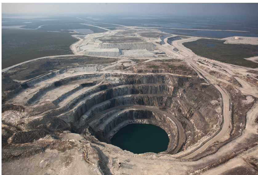
Ekati Diamond Mine from the sky

These leases host the Koala, Fox, Misery Main, Misery South, Misery SW Extension, Pigeon and Sable pipes, as well as the Leslie and Kodiak pipes. Dominion Diamond increased its ownership of the Buffer Zone that surrounds the Core Zone from 72% to 100%. Archon Minerals' participating interest was converted to a royalty equal to 2.3% of all future gross revenue produced from the 89,000-hectare Buffer Zone including the Jay Project and Lynx Pipe.