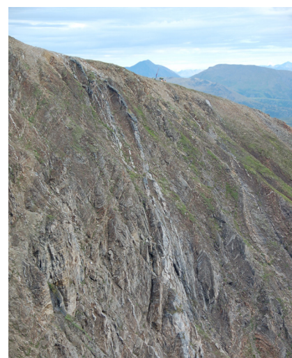
Little Nahanni pegmatites in the Mackenzie Mountains

The demand for supplies of lithium was expected to grow by some eight per cent annually in 2014. However, with the creation of mega lithium-ion battery factories, analysts believe demand will double.