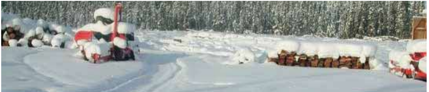
FGH Saw Mill.