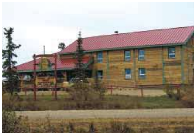
Grey Goose Lodge.