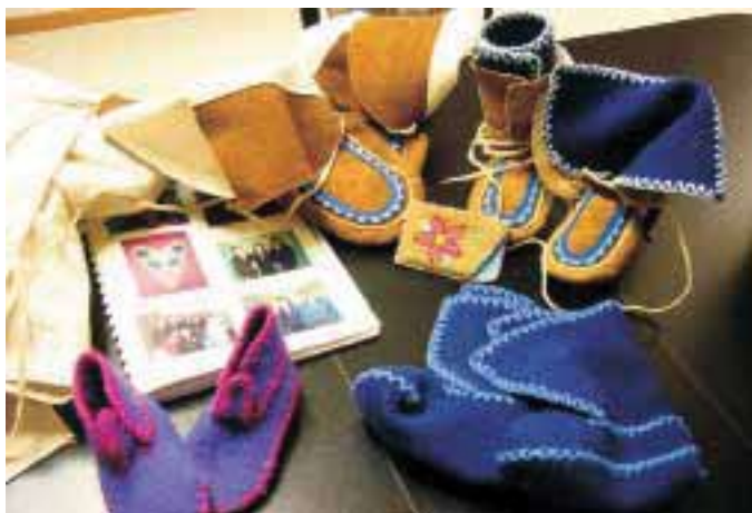
Colville Lake Crafts.