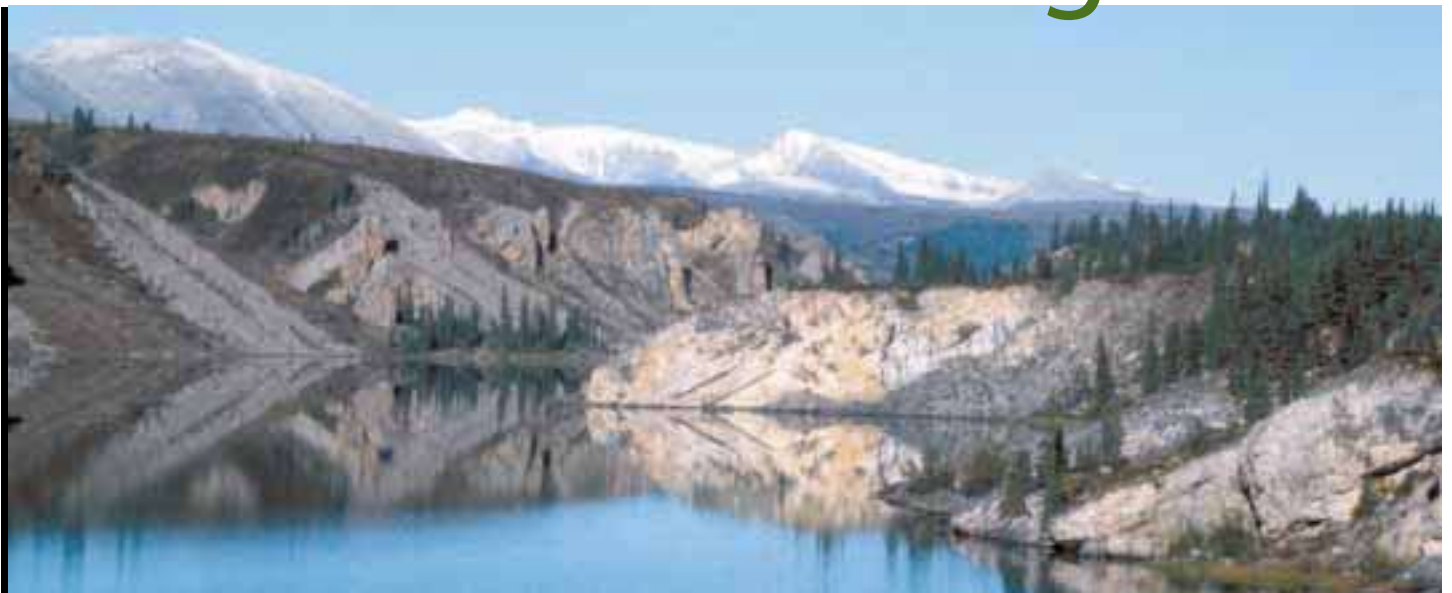
Carcajou Lake.

As part of our role within the Northwest Territories (NWT) vibrant and wide-ranging economic environment – we are balancing our efforts to promote sustainable opportunities in the energy, mines and petroleum resources industries with the development of a diversified economy throughout the NWT.