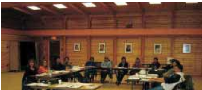
CESO Course in Deline.