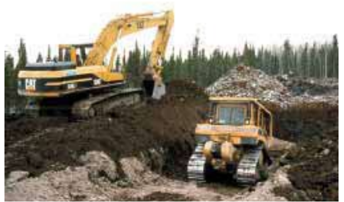
Site preparation - Cameron Hills gas exploration.

Mining may return to the South Slave Region with the proposed Pine Point Pilot Project east of Hay River. This is one of many exploration activities that will provide opportunities for our Region's strategic road, rail and marine transportation links. These key links, combined with an expansion of our service sector, expediting and transport services, will ensure residents and communities in the South Slave benefit from the re-emergence of our mining and mineral exploration sector.