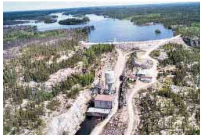
Taltson River hydro dam - northeast of Fort Smith.

Interest in the exploration and production of significant natural gas reserves in the Cameron Hills continues to grow, as do efforts to ensure NWT residents and businesses benefit from this development. Hay River and immediate area is well positioned to capitalize on development in the South Slave Region and from the proposed Mackenzie Gas Project. Having the NWT's only rail terminal and direct access to a river barging transportation system will provide a competitive advantage for regionally based ventures.