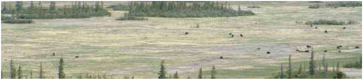
Bison grazing - Salt Plains (WBNP).