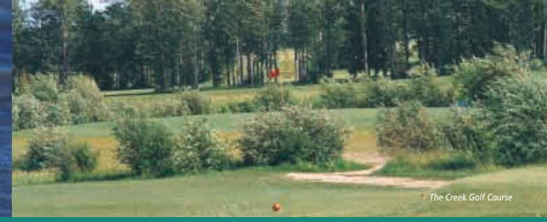
The Creek Golf Course