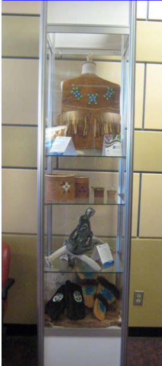
Display Case at Edmonton International Airport's Gate 7 displaying NWT arts and Crafts