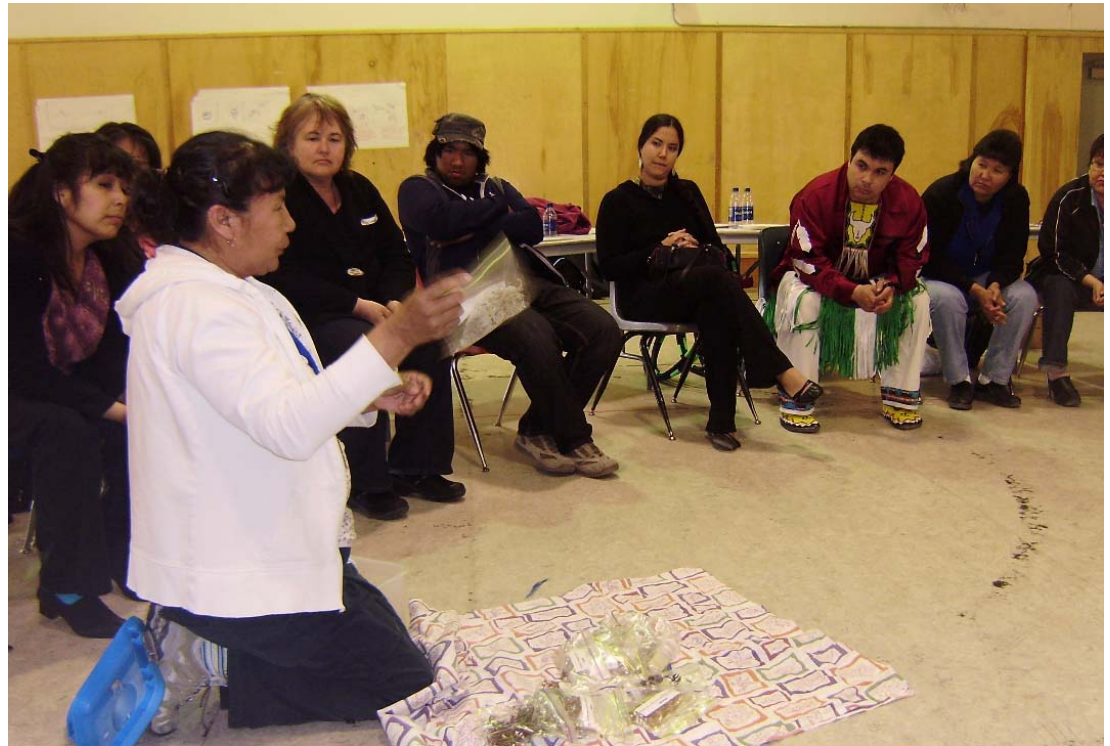
Learning Through The Arts participants observe a workshop demonstration.

A GNWT Newsletter published by the Department of Industry, Tourism and Investment for the Northwest Territories (NWT) Arts Community “Expression of the arts—a vital link to our culture and history”