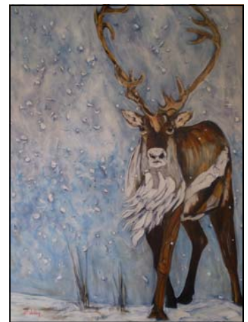
Painting titled, "Soft Snow"