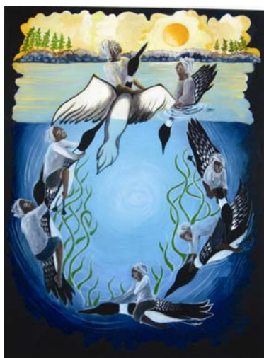
Painting Titled: The Old Man and the Loon