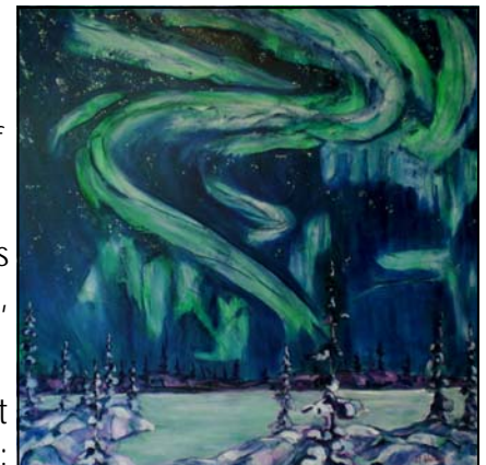
Painting titled, "Aurora Dances"